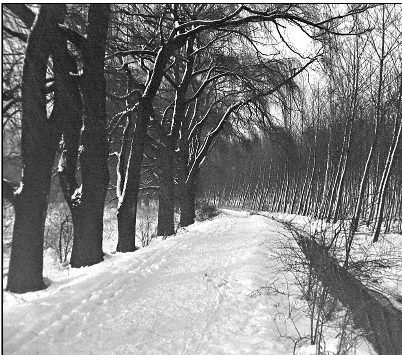
Cesta ve vrbičkách, kolem Litovického rybníka