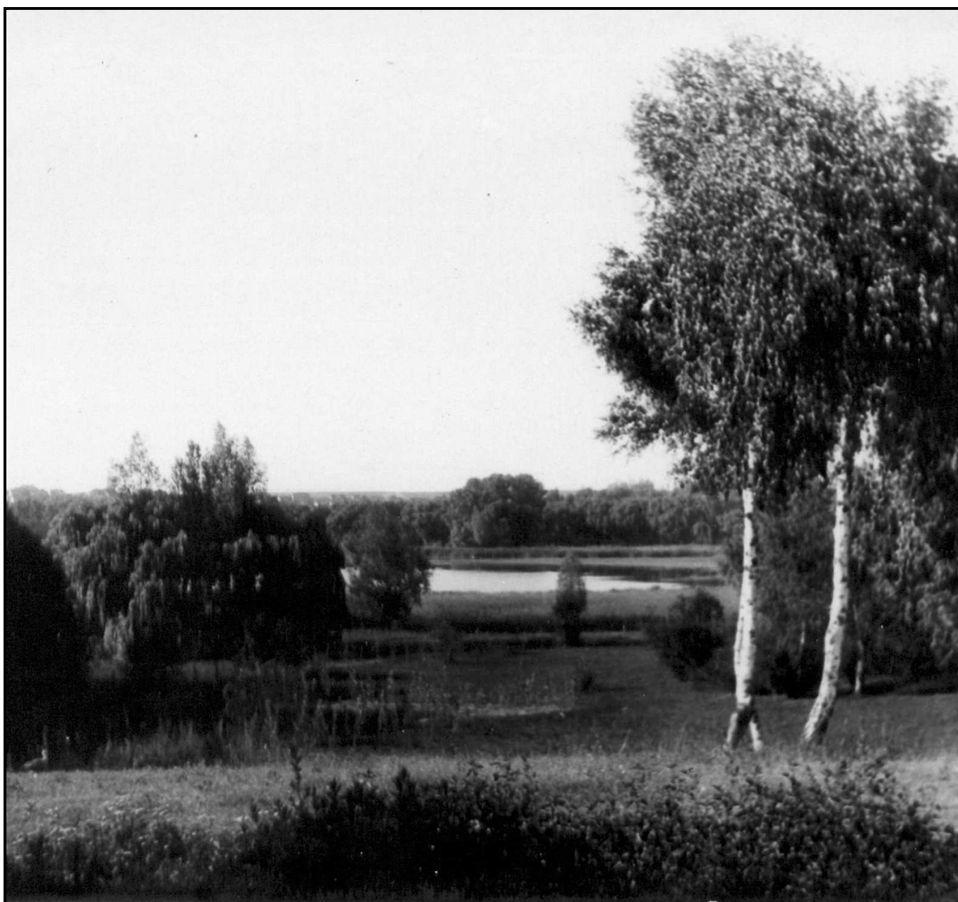
Litovický rybník od Břvů v 60. letech 20. století