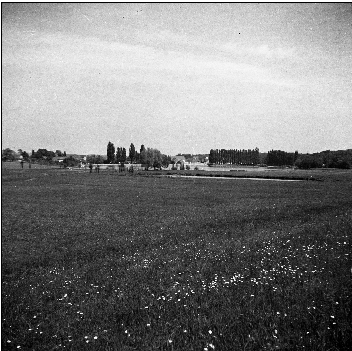
Břevská rákosina v 50. letech 20. století ještě jako květnatá vlhká louka – na snímku Miloše Šrámka