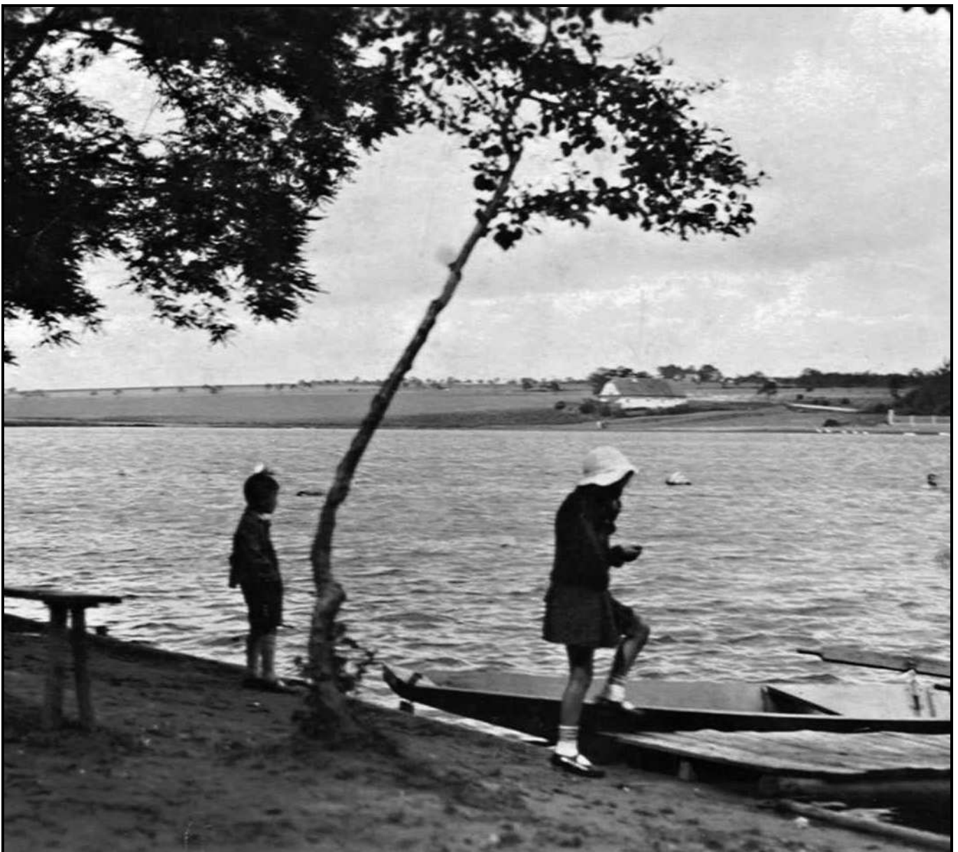
Břevský rybník ve 20. letech 20. století