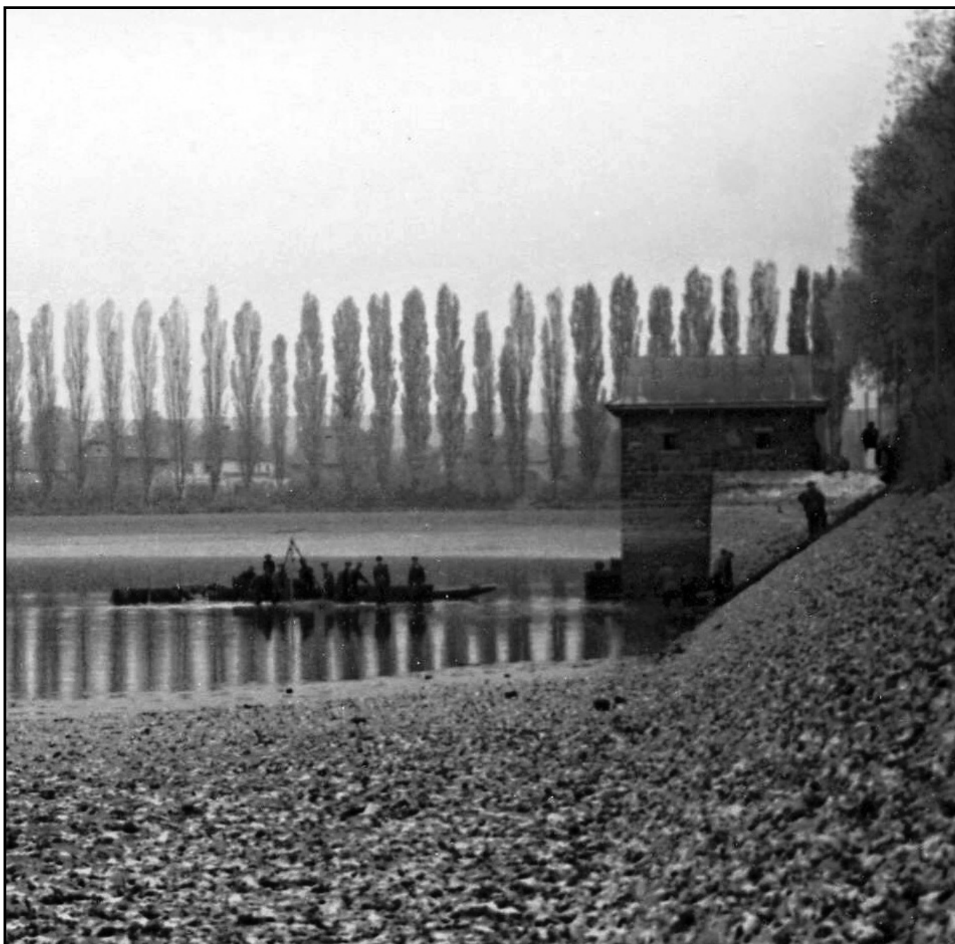
Výlov Litovického rybníka v roce 1953