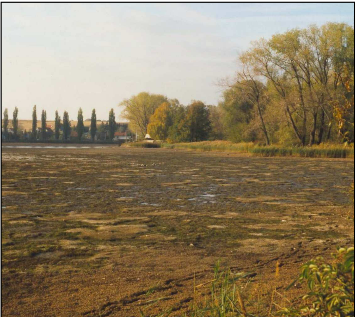
Vypuštěný Litovický rybník