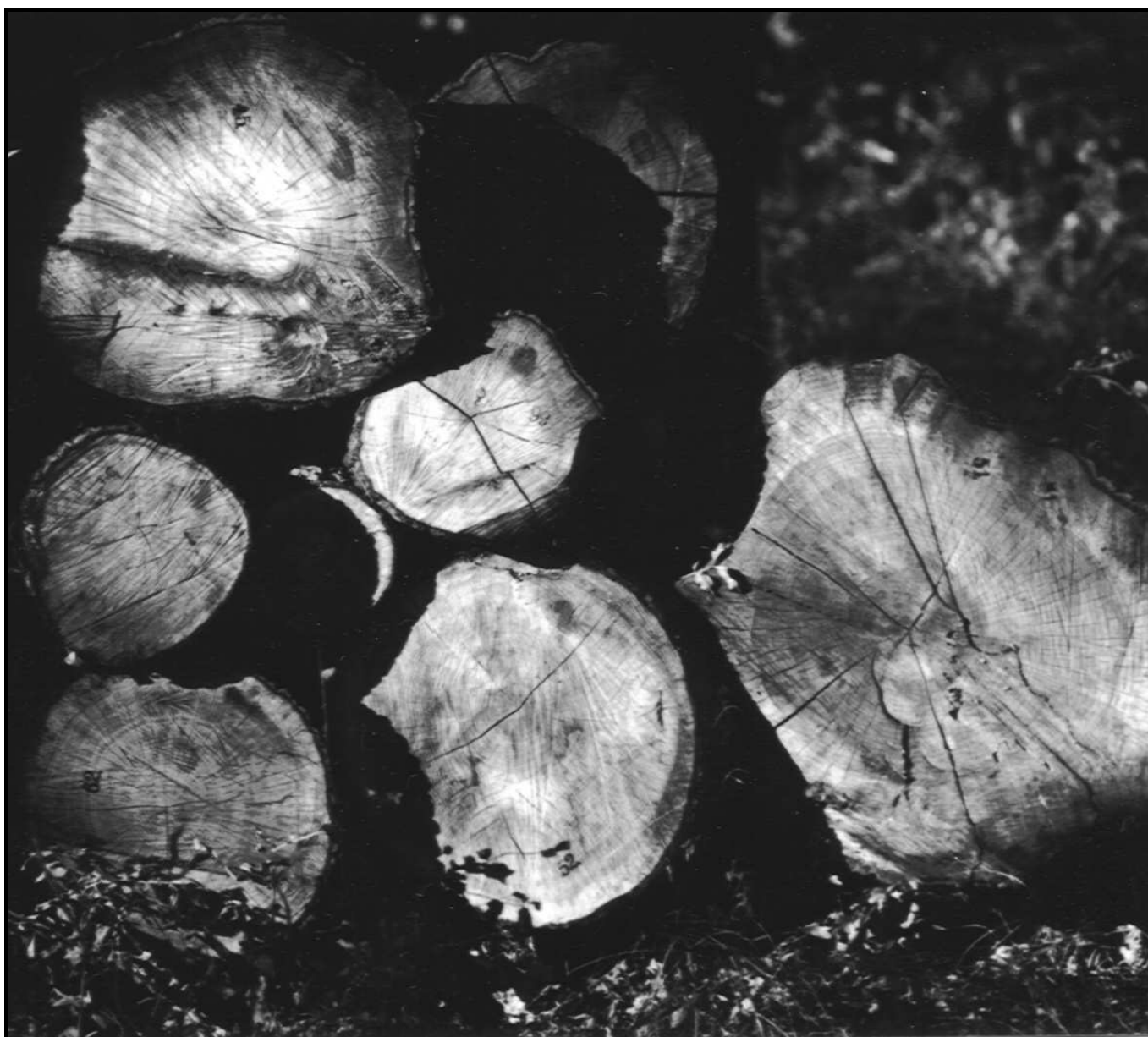
Kulatina z Bažantnice v 60. letech 20. století