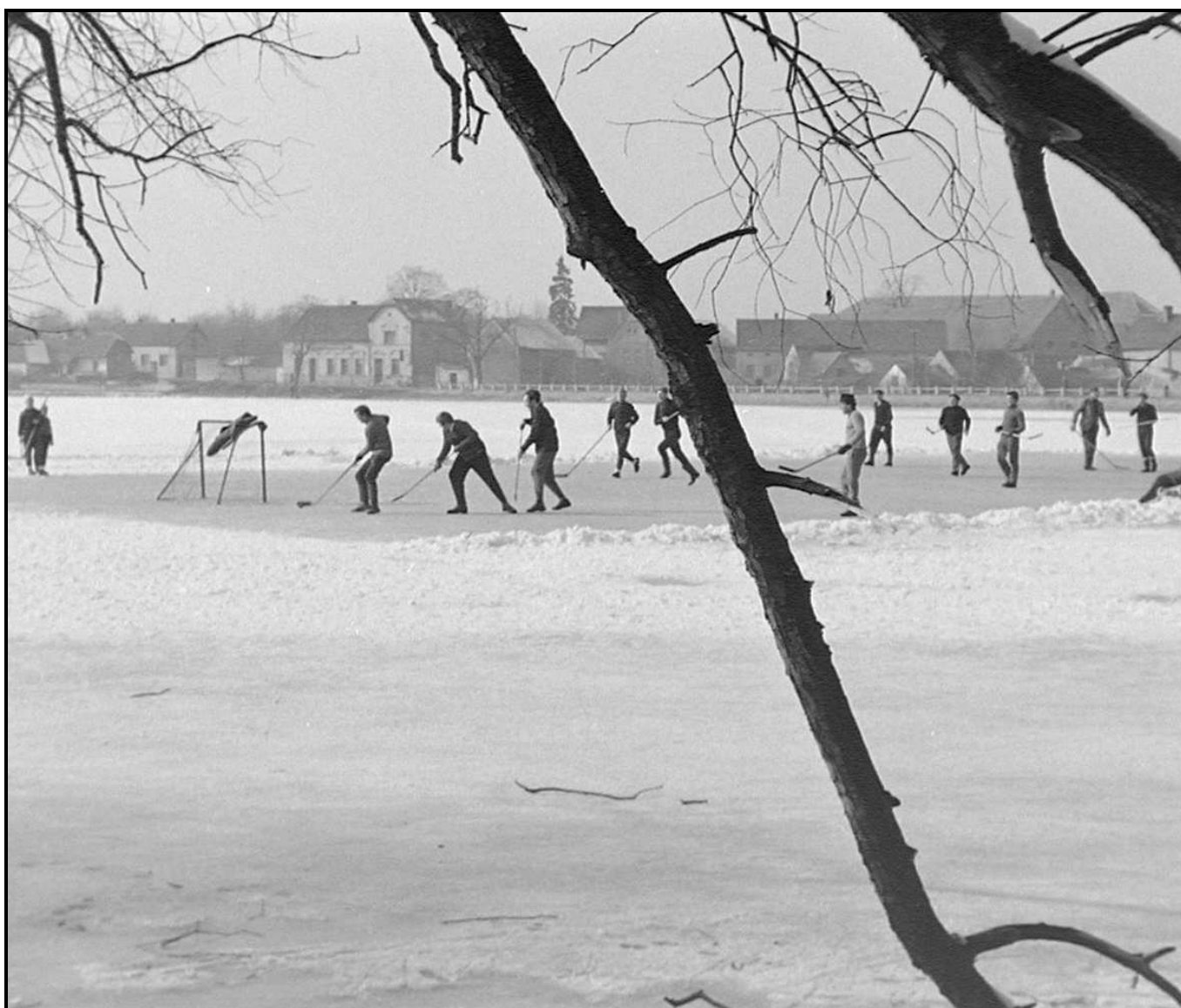
Hokej na Břevském rybníku v roce 1968