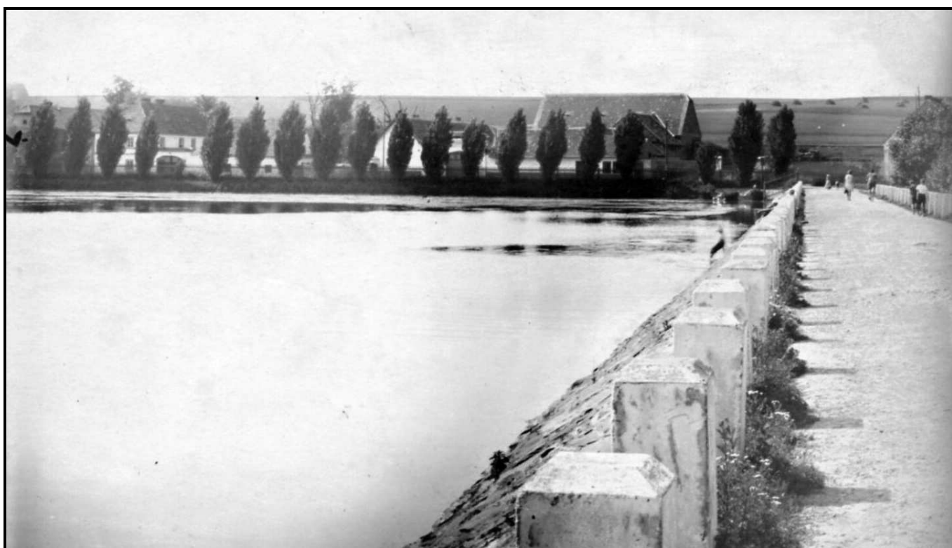
Litovický rybník po obnově ve 20. letech 20. století