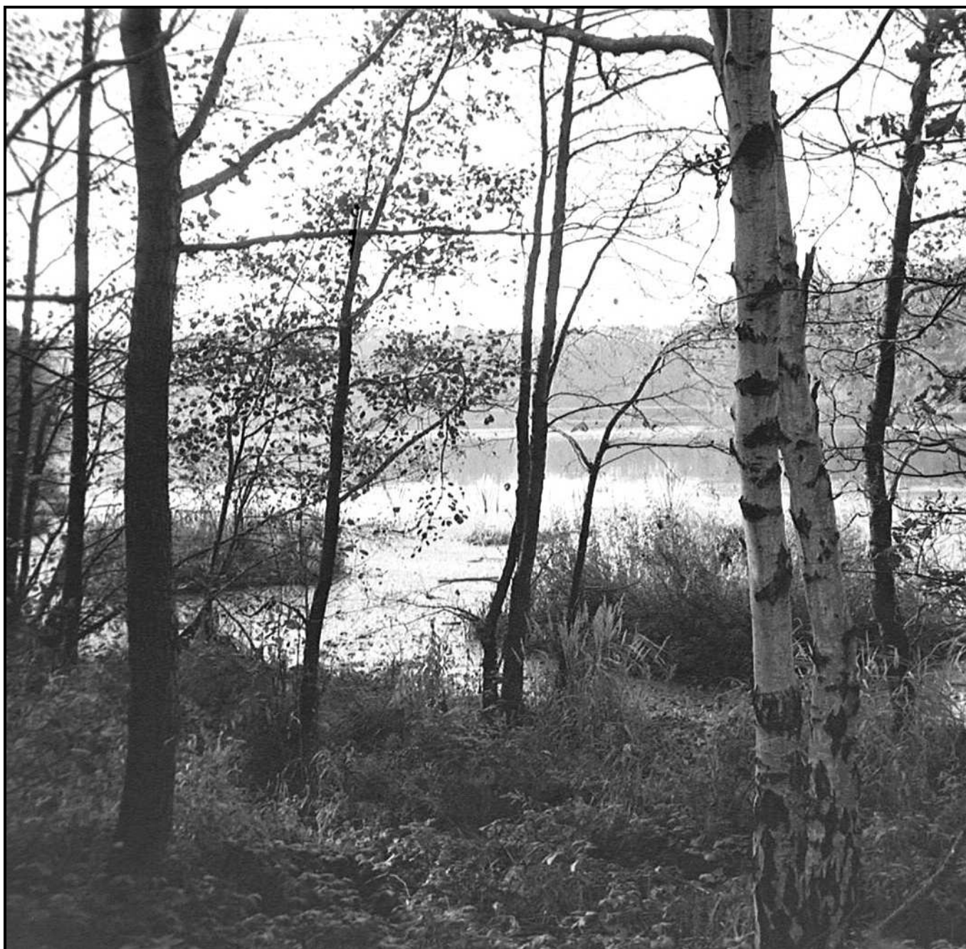
Břeh rybníka Kaly od silnice z Hostivice do Sobína v roce 1970