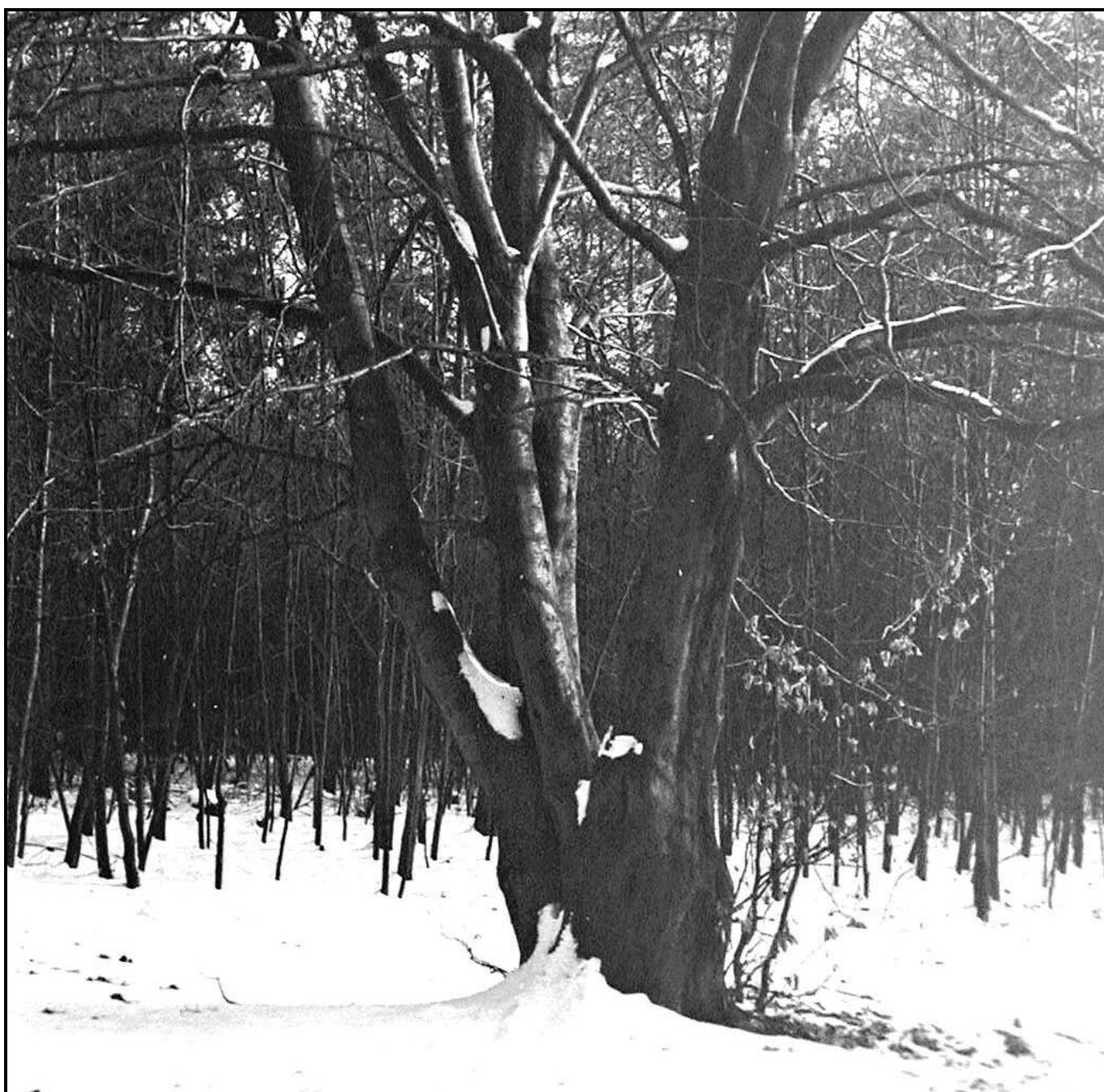
Nádherný rozložitý buk roste ve Stromečkách